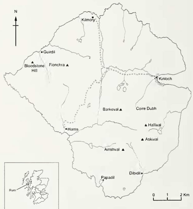
Fig. 1. Isle of Rum map with Papadil towards the south of the island. Insert shows the location of Rum in the Inner Hebrides, to the west of mainland Scotland (Adapted from Butt and Lowe 2004).

Rum is an island managed for conservation and has been described as an “outdoor laboratory” because of the intense study of its nature. However, even here there are locations that have been less well studied but possess specific attributes that are of unique interest to soil ecologists. One such place is Papadil (National Grid Reference NM365 922). This site, towards the very south of Rum, once supported a small crofting community and signs of ridge and furrow cultivation are still evident on nearby headlands. Papadil Loch and the sea beyond, act as one margin to the location which is then surrounded to the north and east by steep slopes of Ainsival (781 m) and to the west by boggy terrain and moorland. Within this, a small (approximately 1.5 ha) area of woodland (predominantly Ash Fagus excelsior and Sycamore Acer pseudoplatanus ) and grassland (dominated by Agrostis spp. and Festuca ovina with Luzula campestris , Primula vulgaris , Anthoxanthum odoratum and Viola spp.) lie to the north-west of the Loch with a south-facing aspect (Fig. 2).